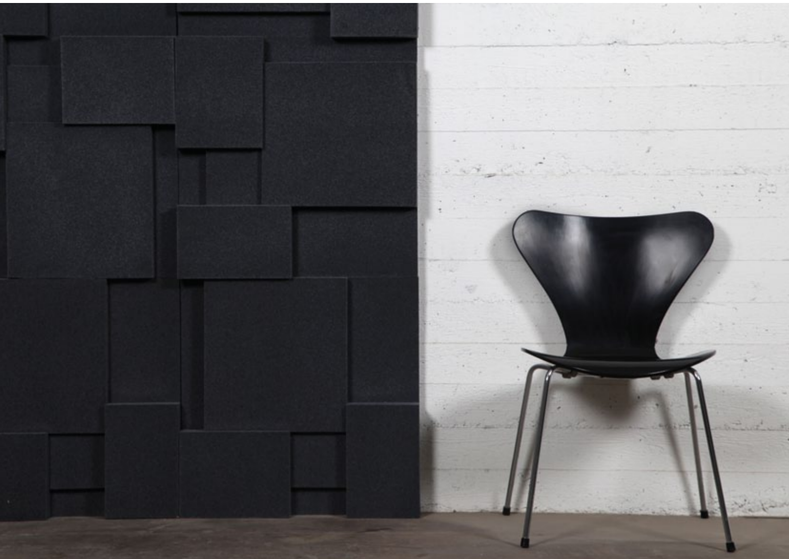
NIVÅ has an interesting 3-dimensional expression with focus on form and function.

AKUSTIKMILJÖ // ENVIRONMENT-FRIENDLY SOUND ABSORBENTS WITH FOCUS ON FUNCTION & DESIGN